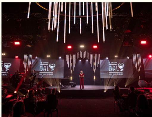
21 st edition of the Grand Bal des Vins-Cœurs

Loterie des Cœurs September 24 th , 2021 $250,000 raised