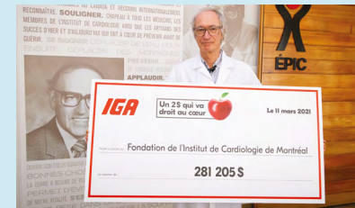
$2 Does the Heart Good 37 th edition February 4 to 24, 2021