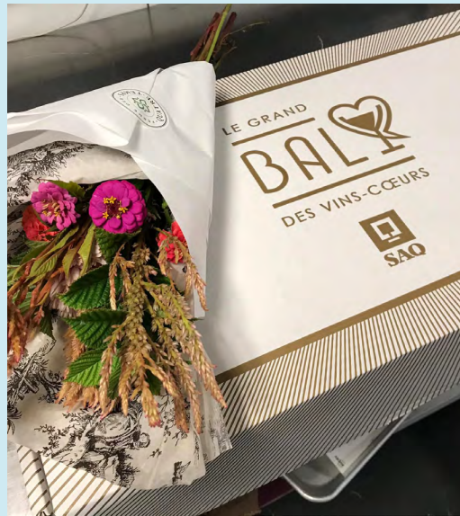
Grand Bal des Vins-Cœurs 20 th edition September 10, 2020