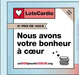
Loto Cardio 26 th edition February 15 to March 31, 2021