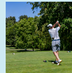
Collecte de fonds Kanawaki 34 th edition August, 2021